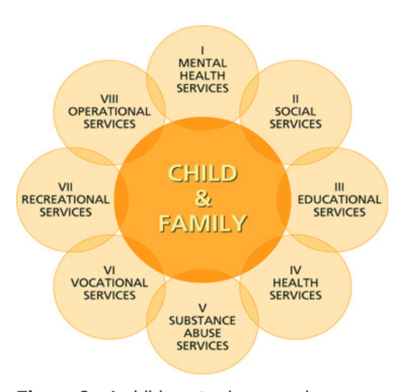
Figure 2 - A child-centred approach

However, teachers alone cannot be responsible for the many and diverse mental health needs of their students; it takes a village. As mentioned above, there are many domains that contribute to our development (physical, mental, emotional, social, spiritual, cognitive, etc.); therefore, a re-organization of our current system is needed to better meet the needs of our students. We suggest that a student-centred approach would be more facilitative of effective service than one that is system-centred. A Systems of Care model encourages student-centred care.